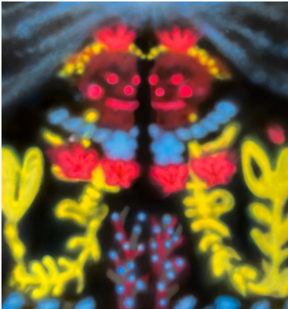
Sea Nymphs , 2022, acrylic and spray on canvas, 58x55 inches

DEAD SEA opens on Wednesday, September 7th with a private preview from 4-6 pm, followed by an opening reception from 6- 8pm, and will be available for public viewing during Alchemy Gallery's open hours: Wednesday through Saturday, noon to 6pm daily, through October 8th, and by private appointment.